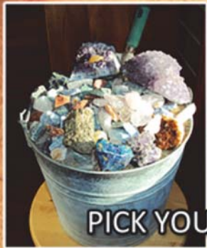
PICK YOUR BUCKET