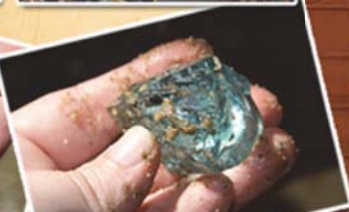
ROUGH BLUE TOPAZ